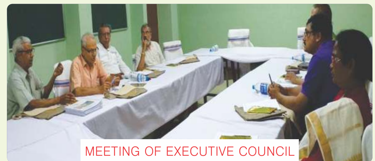
MEETING OF EXECUTIVE COUNCIL